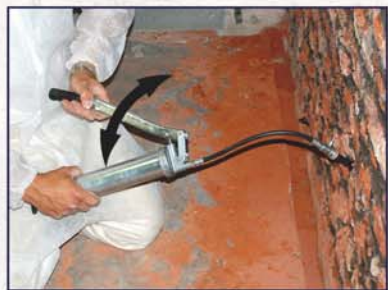
Injection of sealant material